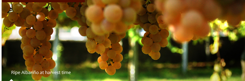
Ripe Albariño at harvest time