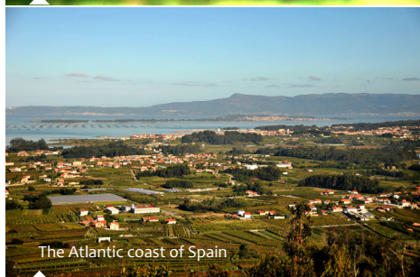
The Atlantic coast of Spain